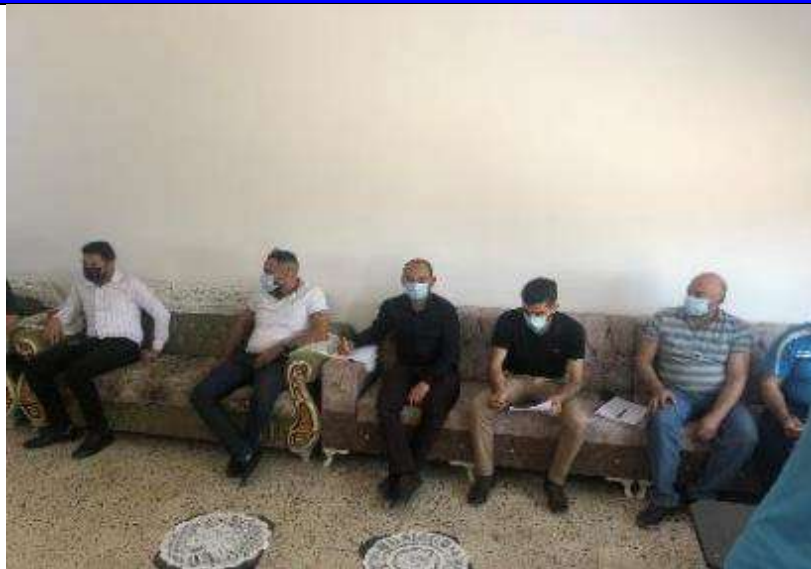
Public Consultations at AL-GHARRAF Village