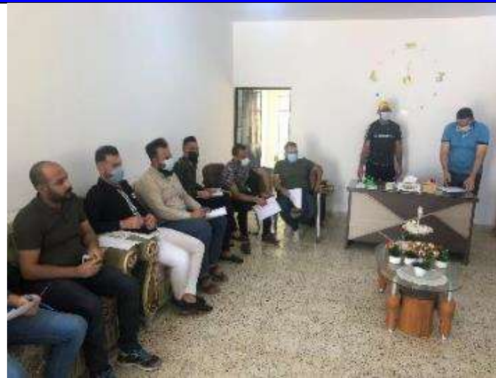
Public Consultations at AL-GHARRAF Village