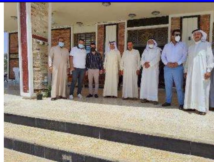
Public Consultations at Abu Sedira Village