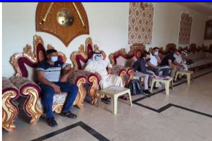
Public Consultations at Abu Sedira Village