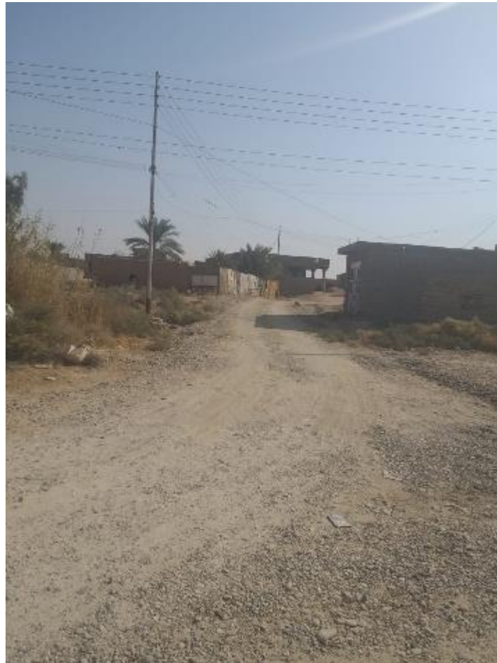
Figure 2: Road in Abu Sedira Village

village by providing asphalt surface to facilitate transport for local communities and road users. Moreover, the road will help the students to go to their school easily. It important to mention that these roads are within the villages as a network, therefore the other roads can be used as alternative roads.