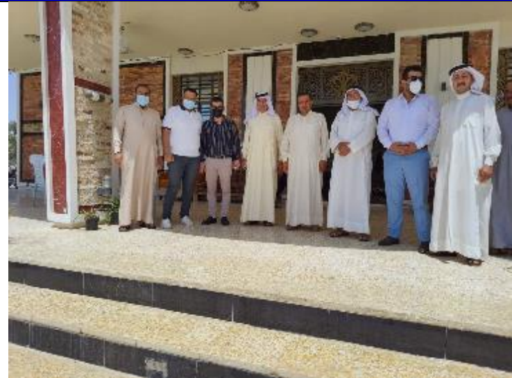
Public Consultations at Abu Sedira Village